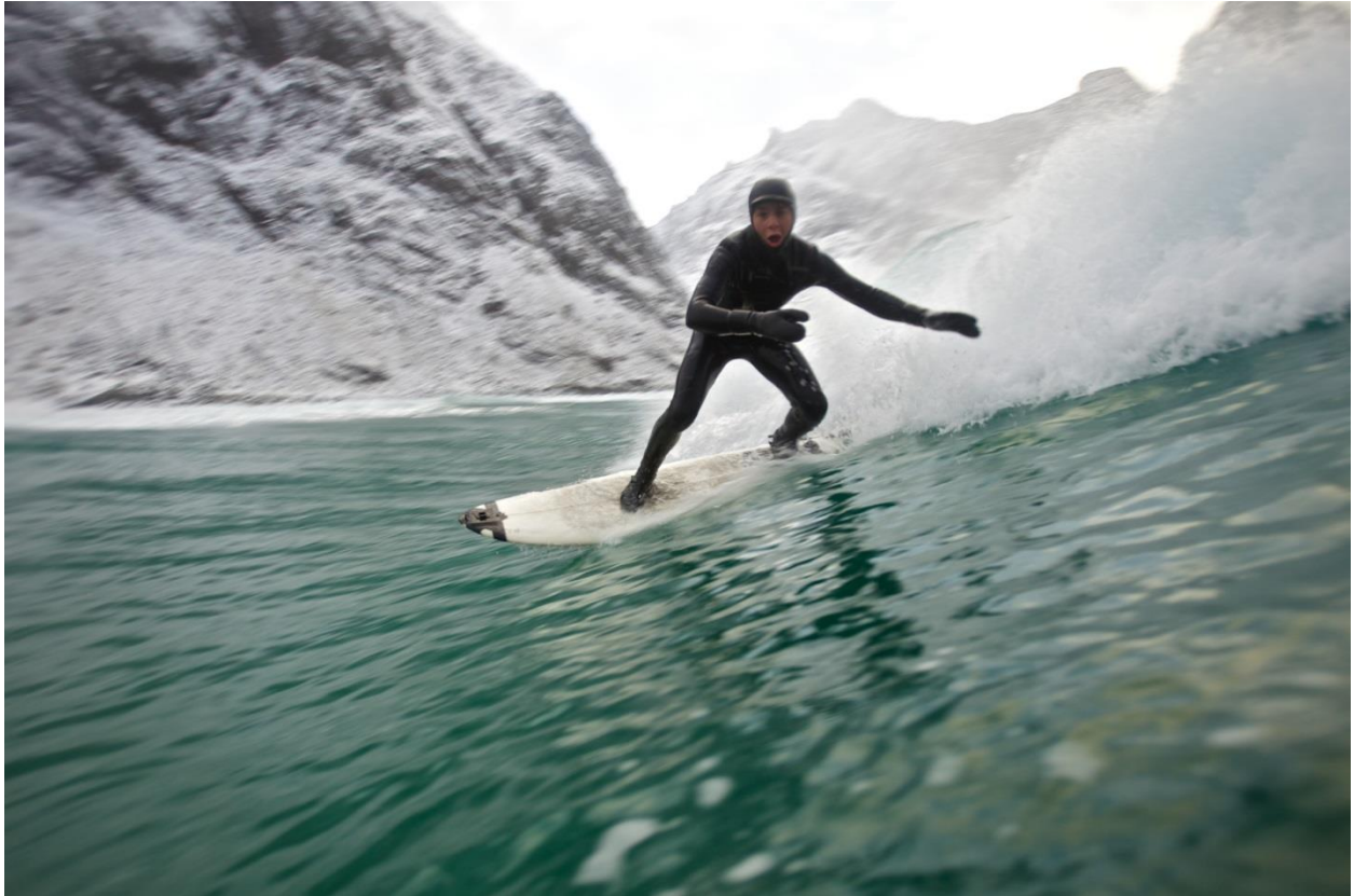
From the film North of the Sun (Nordfor Sola)

Tucked between the cold Atlantic Ocean and the rocky slopes of a remote, arctic island, two young Norwegian adventurers discover their own private playground. They build themselves a cabin out of flotsam while clearing the beach of debris, then spend the long winter skiing and surfing in the haunting low light.