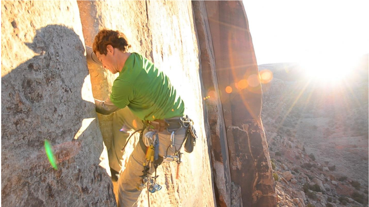
From the film 35

35 routes in one day to celebrate 35 years of life? Why not? Take the birthday challenge!