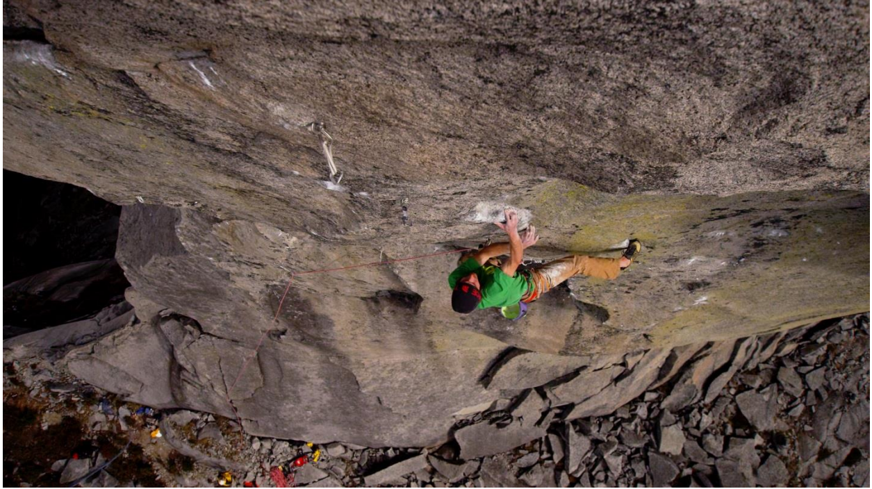
From the film The Sensei

Production Company: Big UP Productions, Sender Films