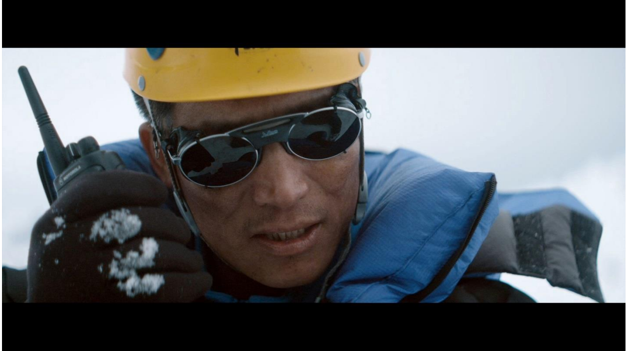
From the film The Summit

In August 2008, 18 climbers reached the summit of K2. Forty-eight hours later, 11 people were dead. What happened on that fateful day has never been fully resolved. The Summit uses found footage, realistic reenactments, and interviews with survivors, as it zigzags back and forth in time, interweaving multiple narrative threads to piece together one of the deadliest days in mountain-climbing history. Through breathtaking cinematography, director Nick Ryan creates a tension-filled experience that will have you on the edge of your seat.