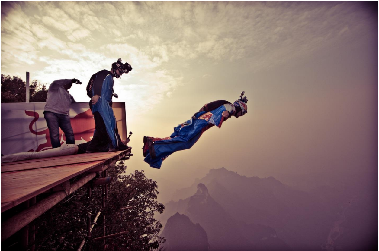
From the film Heaven's Gate

Production Company: Pan Pacific Entertainment