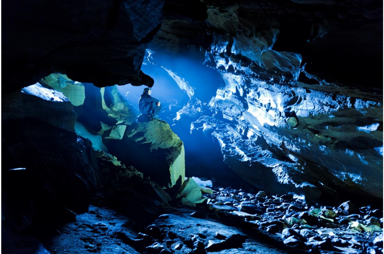
From the film 'The Secrets of the Glom Mountain'

Accompanied by his pouty teenage daughter, nature photographer Tom Edvindsen returns to the labyrinths and caverns of Glom where he hunted exotic beasts as a boy. While his daughter slumbers long into the day, he delights in the knowledge that coiled serpents and fanciful creatures still linger.