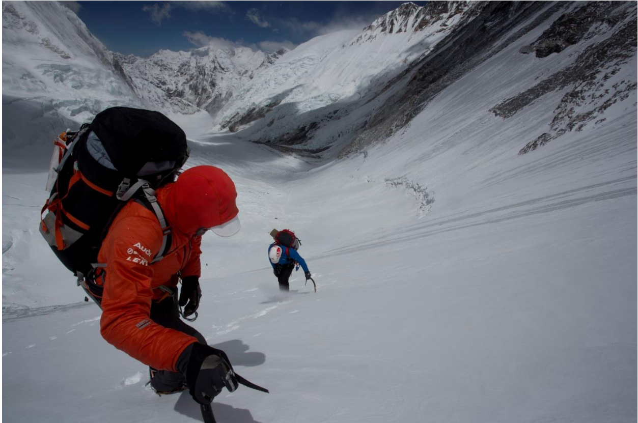
From the film 'High Tension'

Production Company: Sender Films, Big UP Productions