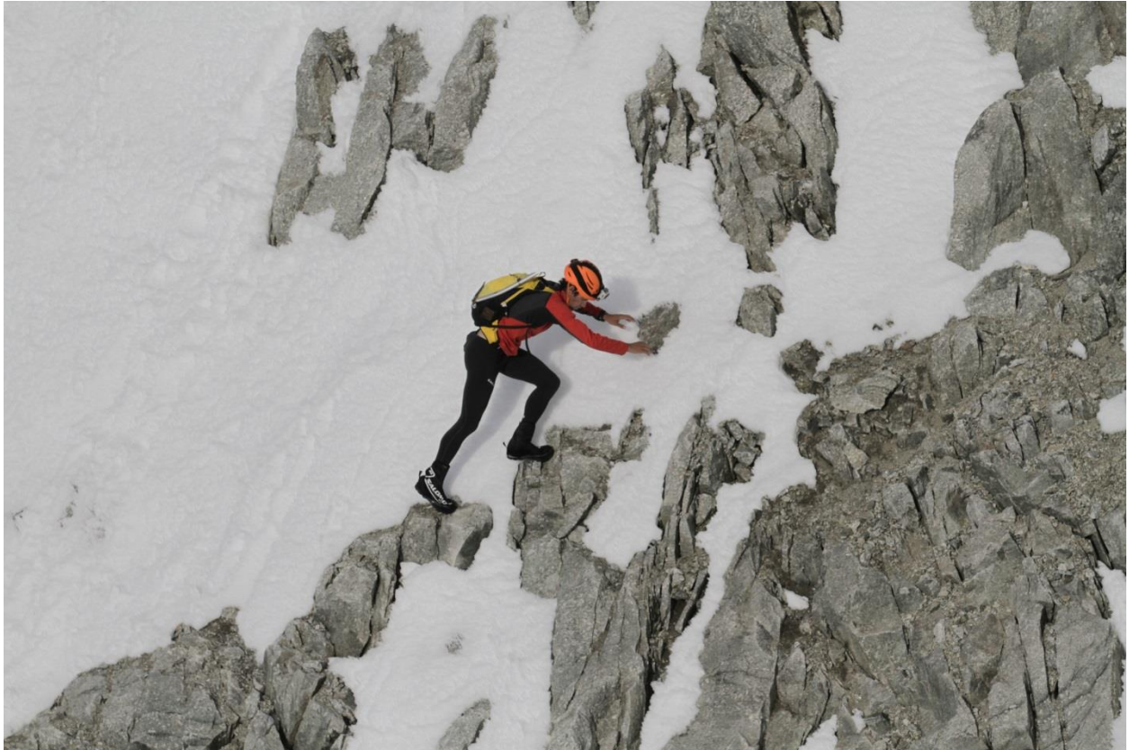
From the film A Fine Line

Production Company: Montaz-Rosset, Lymbus