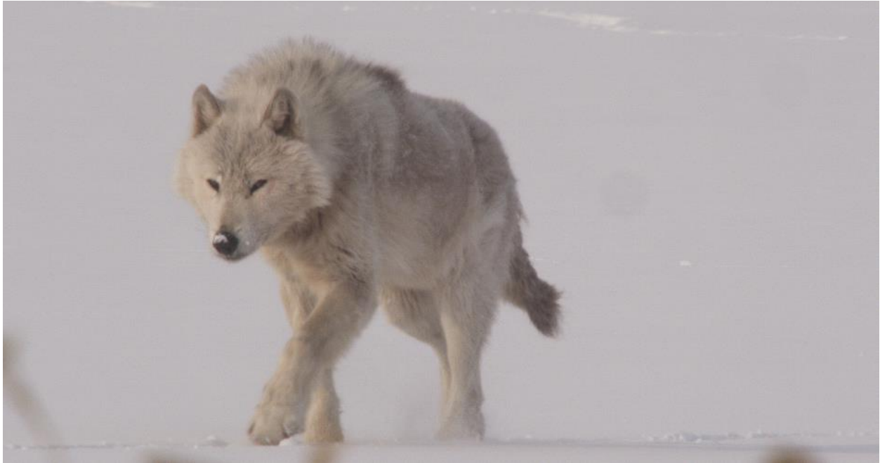
From the film Cold Warriors: Wolves and Buffalo

Production Company: River Road Films in association with CBC, BBC, WNET Nature, PBS