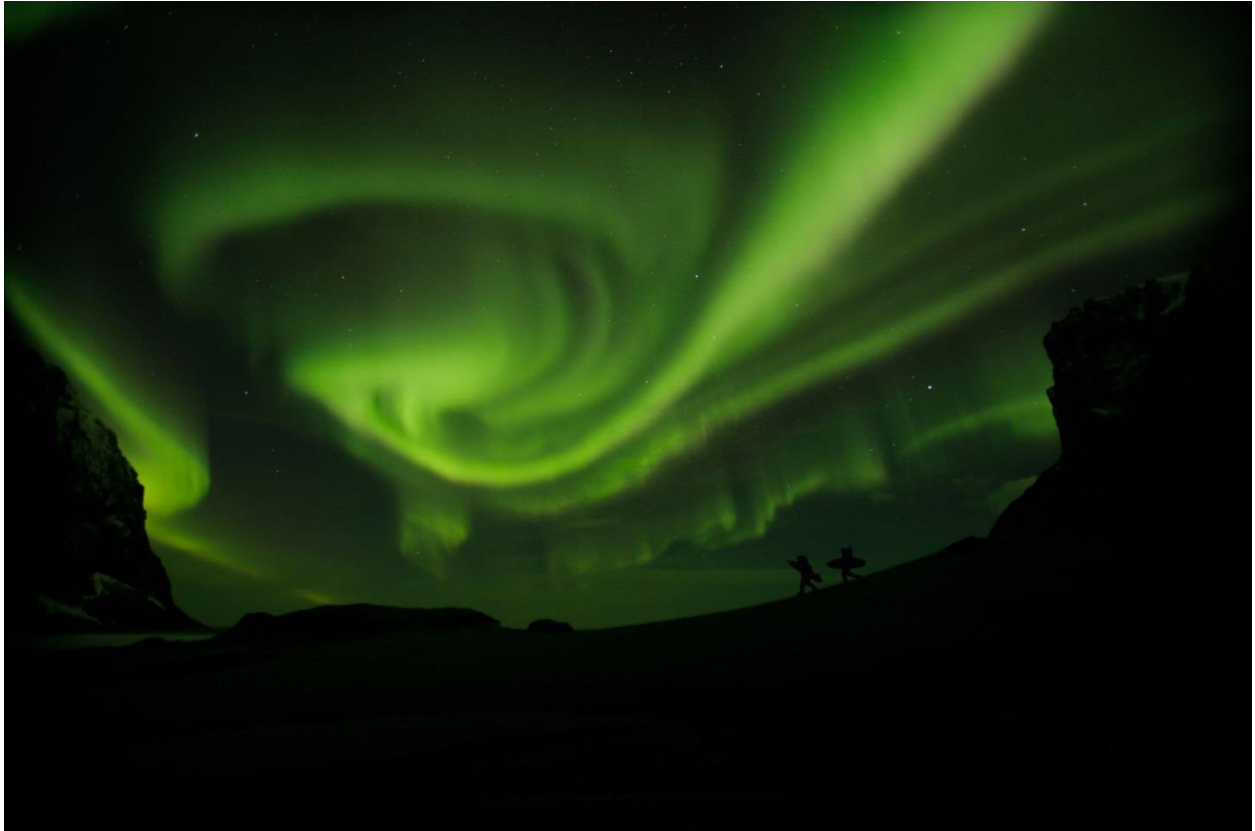
From the film 'Nordfor Sola (North of the Sun)

Tucked between the cold Atlantic Ocean and the rocky slopes of a remote, arctic island, two young Norwegian adventurers discover their own private playground. They build themselves a cabin out of flotsam while clearing the beach of debris, then spend the long winter skiing and surfing in the haunting low light.