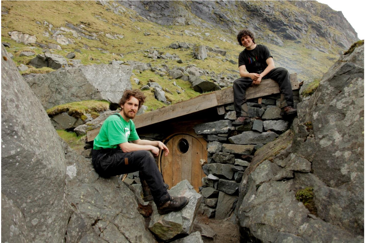
From the film North of the Sun (Nordfor Sola)

Tucked between the cold Atlantic Ocean and the rocky slopes of a remote, arctic island, two young Norwegian adventurers discover their own private playground. They build themselves a cabin out of flotsam while clearing the beach of debris, then spend the long winter skiing and surfing in the haunting low light.